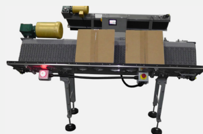
BENCHMARK TILTED CASE CONVEYOR