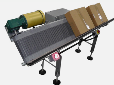
TILOED CONVEYOR GRAVITY TRANSFER

Benchmark designs and manufactures high-performance, low-maintenance, easy-to-operate product handling systems for manufacturers, including distribution systems, automatic cartoner infeeds, shuttle and disk feeders, stackers, mergers, tray loaders, and slug loaders. Benchmark is a product brand of ProMach, a global leader in packaging line solutions. As part of the ProMach Handling & Sterilizing business line, Benchmark helps our packaging customers protect and grow the reputation and trust of their customers. ProMach is performance, and the proof is in every package. Learn more about Benchmark at www.BenchmarkAutomation.net and more about ProMach at ProMachBuilt.com .