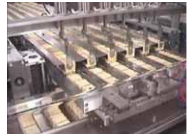
Independent measuring pins gently enter the continuous lanes of on-edge product.

The Multi-Lane SSL combines reliable operation with gentle product handling. Slug length is controlled using a servo driven measuring arm. A floating pin gradually enters the lanes of on-edge product to minimize damage.