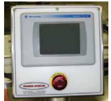
Color touch screen operator interface allows slug length changes while running or by recipe selection.